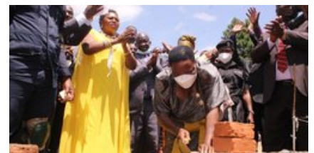
Prime Minister Robinah Nabbanja commissions the construction of a community social centre in Bundibugyo District at the weekend. Locals tasked the President to fulfill pledges to the district.

“Stop living reckless lives by spending your money on alcohol,” the President said.